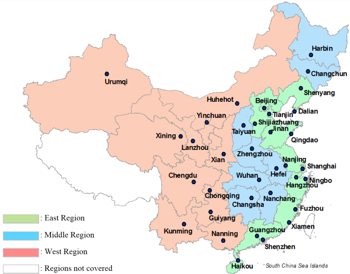
Figure 1: 35 Major Cities Covered